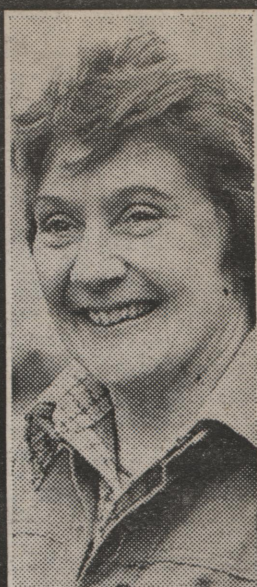
SHIRLEY—in UFO's path

■ AN amazing UFO Close Encounter involving broadcaster David Jacobs and politicians Shirley Williams and Jonathon Porritt set Britain buzzing yesterday.